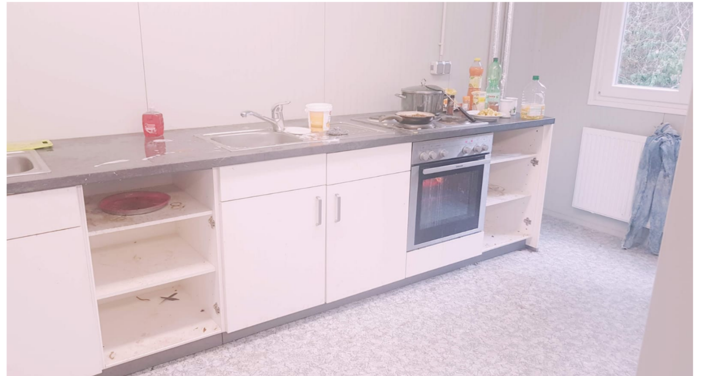
Kitchen in a refugee reception center in Bonn. Photo: Elene Shubladze, September 2019.

The research was conducted between July and October 2019. The methods used were participant observation, informal conversations and semi-structured interviews with 16 refugees from the Middle East.