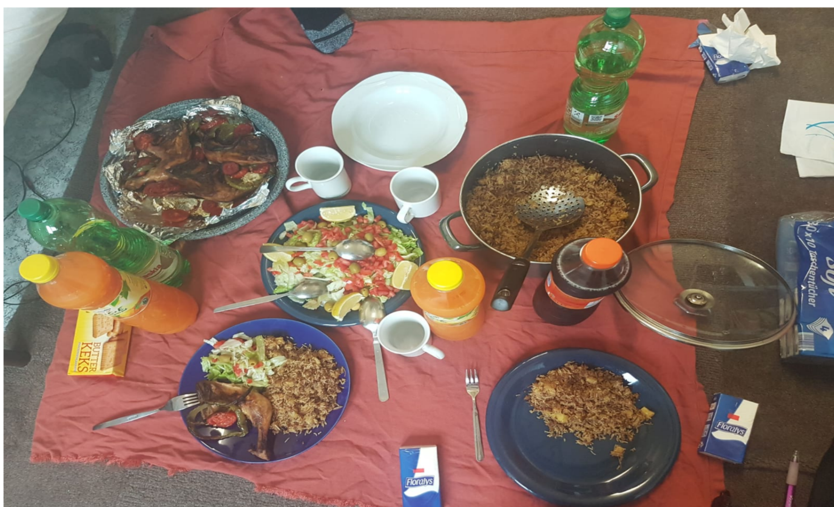
Home-made meal in a refugee reception center in Bonn. Photo: Elene Shubladze, September 2019.